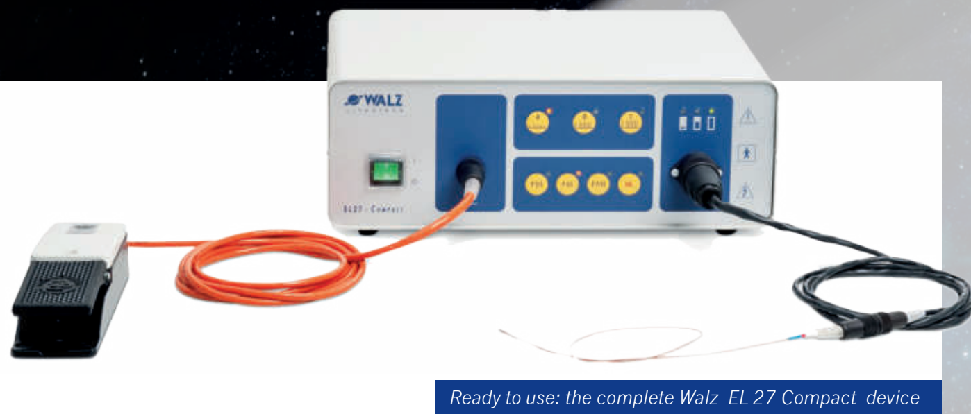
Ready to use: the complete Walz EL 27 Compact device